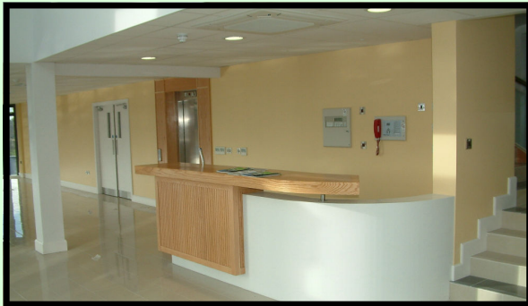
Shared Reception Area

Provided by IRD Kiltimagh Ltd, the local Community Development Company, in an effort to drive the social and economic development of the Kiltimagh area, you can be assured of the support and assistance of the entire community in maximizing the potential of your business.