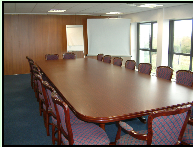
Shared Meeting / Training Rooms